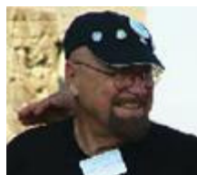
Family patriarch Moshe Shaltiel's Facebook